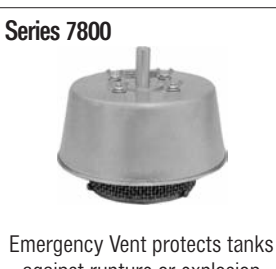
against rupture or explosion resulting from excessive internal pressure caused by exposure to fires.

Pipe-Away Pressure Vacuum Relief Vent for applications that require hazardous vapors be processed into manifolded piping and not released into the atmosphere.