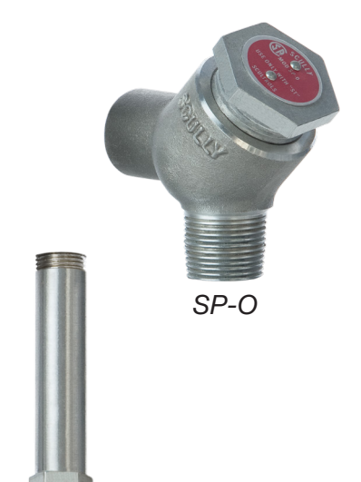
FEATURES AND BENEFITS

The SP-M and SP-IO style sensors have a .95mm NPT mounting thread and are generally used in conjunction with an SP-O or SP-H style holder. The sensors can be easily extended to the desired installation depth using standard 9.5mm IPS pipe and a pipe coupling. The SP-O elbow holder is generally used when a single sensing point is needed. It can accommodate either an SP-M or SP-IO sensor and mounts into a 19mm NPT opening in the tank. The SP-H holder allows for up to 3 SP-M and/or SP-IO sensors to be conveniently installed into a single 5mm NPT tank opening. SP-H holders are commonly used to implement multiple high-level and low-level warning points. Both sensor holders are threaded to accept a 12.7mm NPT conduit fitting.