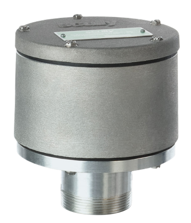
SP-H Holder (for 1–3 sensors)