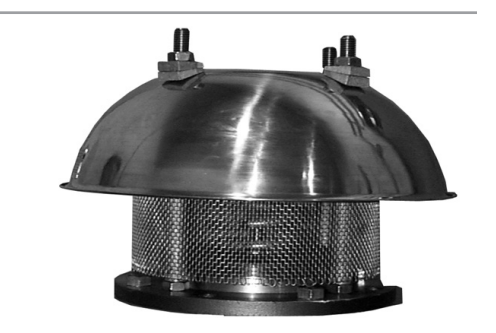
Table AB - Size, Material, Configuration & Flange