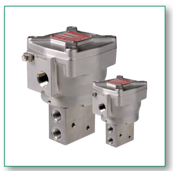
Reliable, industry proven solenoid technologies