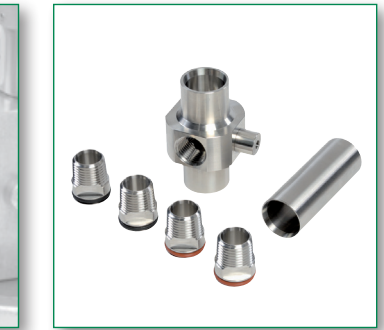
All major hazardous area approvals available.