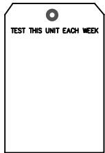
SP170 TEST TAG