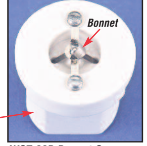
WST-02B Bonnet Sensor