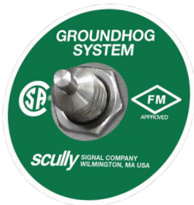
Scully Ground Bolt