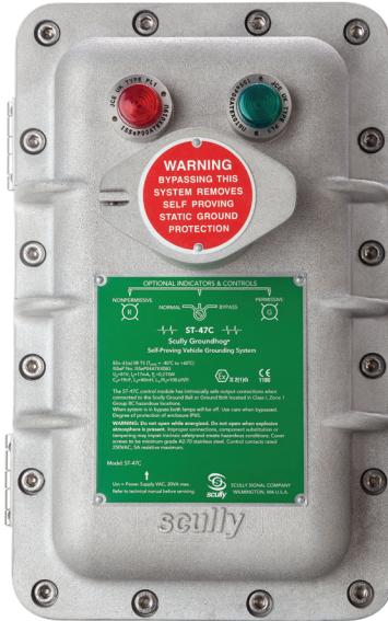
Groundhog Earthing Verification System

Featuring Dynacheck® – Automatic and Continuous Self-Checking Circuitry