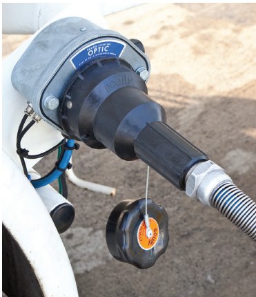
One Connection for Overfill Prevention and Earthing