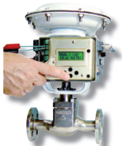
With push buttons for menu navigation and a liquid crystal display, the local user interface allows you to configure and calibrate the DVC2000 instrument in any one of seven different languages.

The PlantWeb® digital plant architecture offers proven improvements in system availability, reduced variability, increased throughput and enhanced product quality.