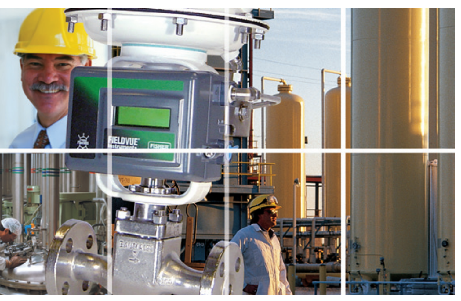
For a Wide Range of Industrial Processes