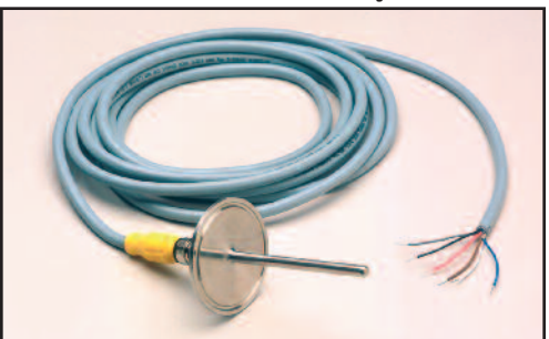
SPD Sanitary Probe Shown with Cable #12071-02